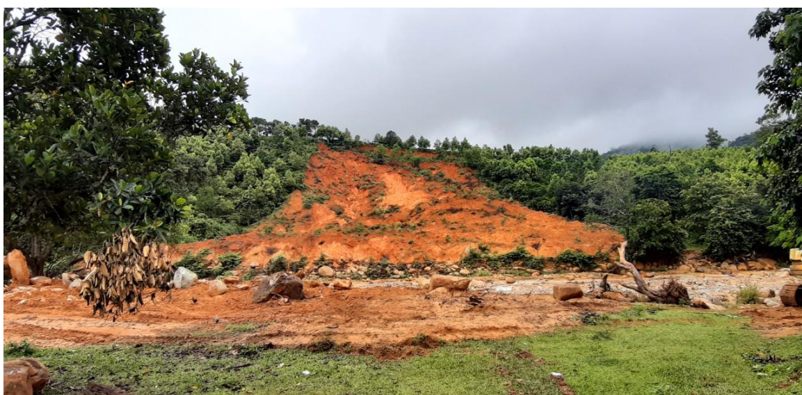
Landscape being recovered with bamboo trees, grass and rocks