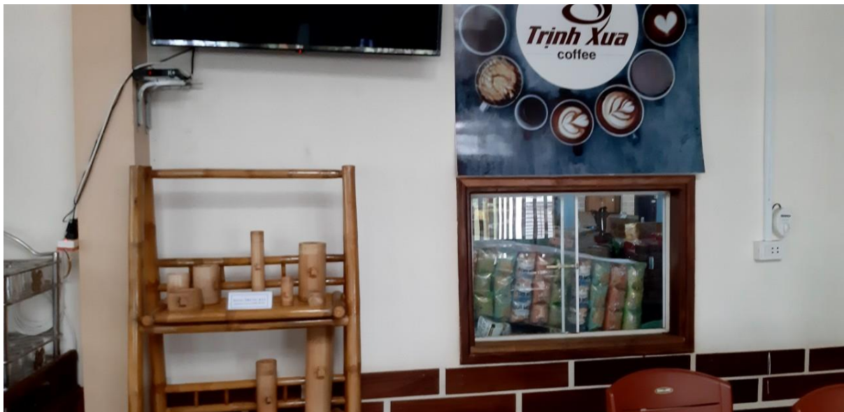
Bamboo products available at a café in central Huong Phung commune