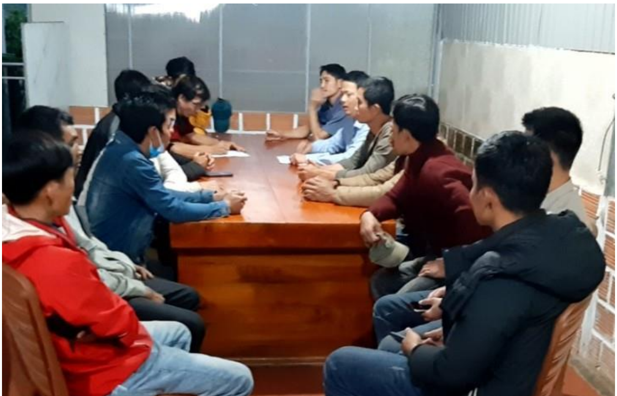
Wrap-up meeting with production group members

A wrap-up session on the last day was facilitated by MCNV with the participation of the local facilitator and all the group members. The purpose of this meeting were to consolidate lessons learnt among the groups in the first three days, develop upcoming learning exchanges, and update of cooperative opportunities for expanding the groups' business.