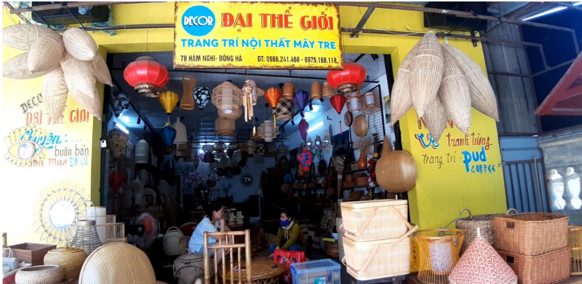
Depositing Krong Aho at a handicrafts shop in Dong Ha city

MCNV has supported the sales representative of the production groups to develop a market plan. As part of it, during this period Krong Aho bamboo products were just kept on shelves at mini-marts, shops and cafés with an aim to improve customer outreach.