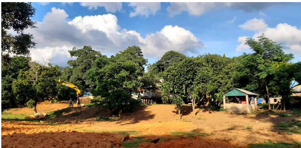
Site clearance for improving whole landscape with grass and stream rocks and stones