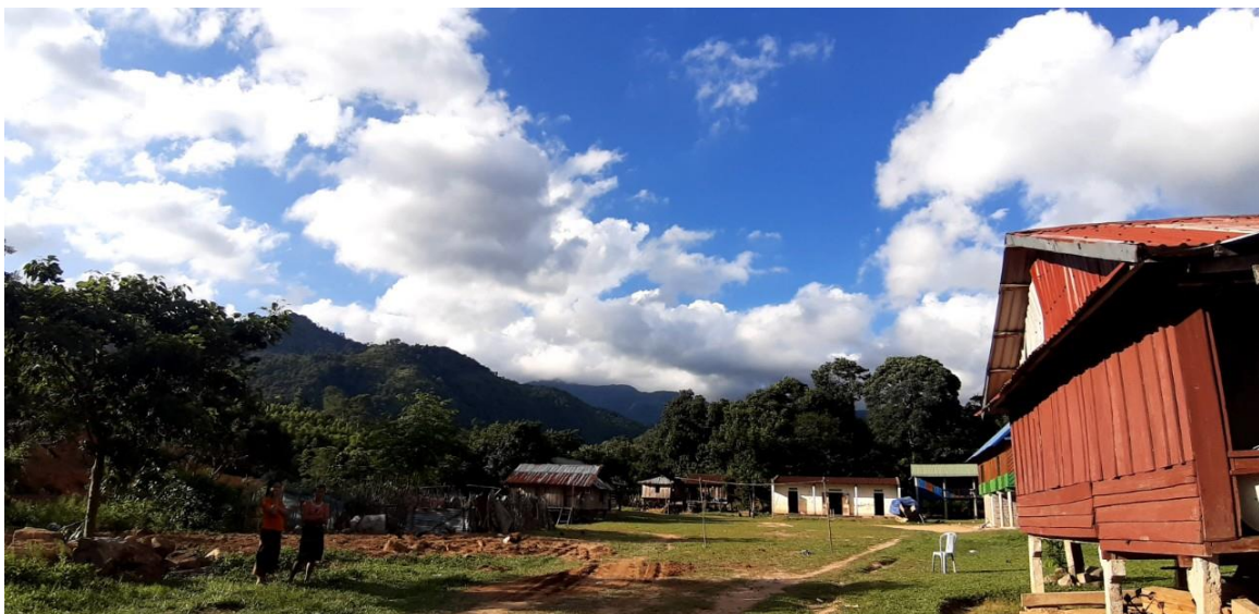
Whole landscape of Chenh Venh Eco-Tourism Village under construction