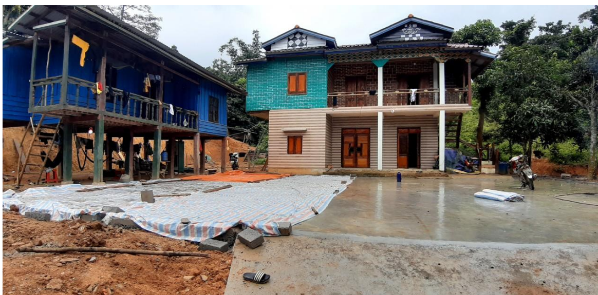
General ground for drying agricultural products in Chenh Venh Village (completed)