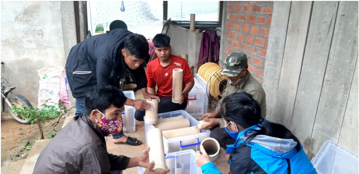
Learning moment with Ma Lai Pun production group

Viet commune was invited to take part as a local facilitator. Participants were all the members of six production groups in neighboring communes of Huong Phung and Huong Son. The event was held in four days, in which three first day the local facilitator came to work directly with two production groups, strengthening the relationships, making sample products and sharing technical and management experience.