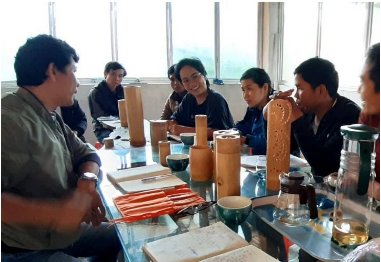
Joint meeting for linking and expanding Krong Aho business

After several field trips to work with relevant parties, MCNV organized a joint meeting among Pun Coffee, representative of local authority, and production groups in communes of Huong Viet, Huong Son and Huong Phung. The aims were to discuss about how to expand the producing and trading of Krong Aho products, and promote the cooperation between Pun Coffee and the production groups.