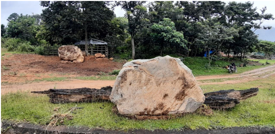
Entry to Chenh Venh Eco-Tourism Village (not yet completed)

The business of Van Kieu Bamboo Cooperative would focus on not only producing and trading Krong Aho products but also eco-tourism development. The whole district has recently been an attractive destination to tourists with farmstay and homestay models, bungalows, and waterfalls, etc. Located in the same commune with the Chenh Venh Eco-Tourism Village that is being built, the Cooperative would take advantage of this opportunity to expand its business and design community eco-tours. Once completed in late 2021, the Chenh Venh Eco-Tourism Village would put into operation with numerous services: check-in and photographing at landscapes, homestay with traditional food and drinks, gong festive (combined with campfire, folklore performance, BBQ), outdoor activities (trekking, swimming, exposure visits to Krong Aho producing facilities, coffee harvesting tours), and a mini-market with traditional products (fish, bamboo shoot, Krong Aho products with on-site laser engraving service, etc.).