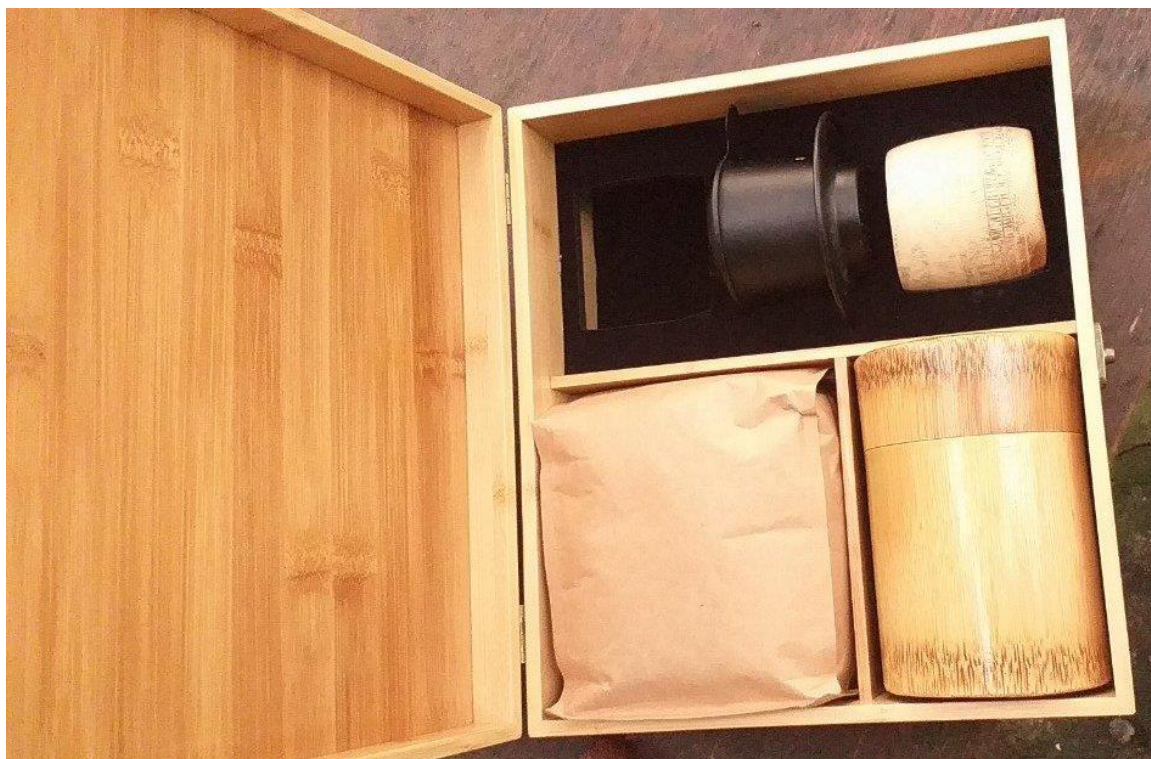
New design of giftset consisting of bamboo coffee box and cup with Pun Specialty Coffee

The production groups would be able to expand their business as long as they obtain a legal entity. As such, relevant parties came up with an initiative of establishing a Van Kieu 1 Bamboo Cooperative – an umbrella organization with the representation of Pun Coffee and production groups with equal responsibilities and benefits. The general objectives of this initiative are to contribute to sustainable forest management and development through the exploitation of non-timber forest products and promoting eco-tourism models, and generate income for the members of ethnic communities.